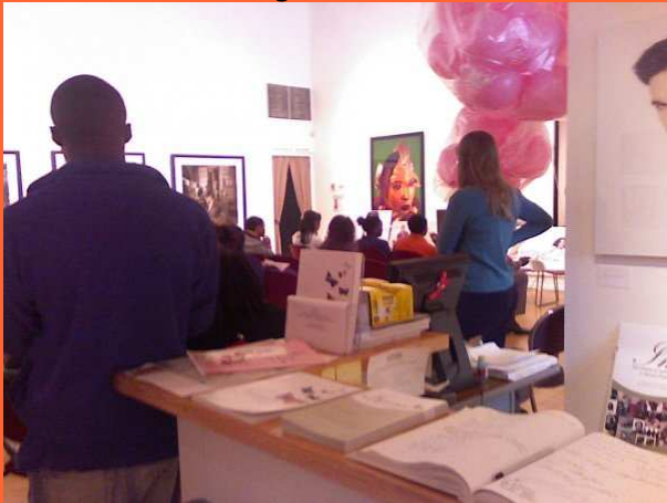
Photo Info: TGP EVENT at Rutgers- Newark's Paul Robeson Art Gallery As you may know, The Gem Project management has changed. Our main goal starting 2010 has been to strengthen our infrastructure. There are many elemental factors that can lead us to this goal.